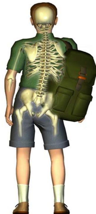
Always use both shoulder straps

Educate Your Kids. As children get older and the homework level increases, so does the weight of their backpacks. Make sure to educate your kids about the real risk of neck or spine injury.