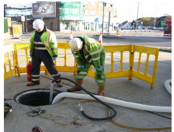
Please note this photo was taken at another site and is for re-enactment purposes only